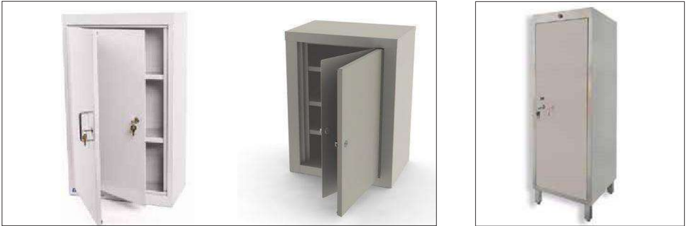
AND-F2347/ AND-F2348/ AND-F2349