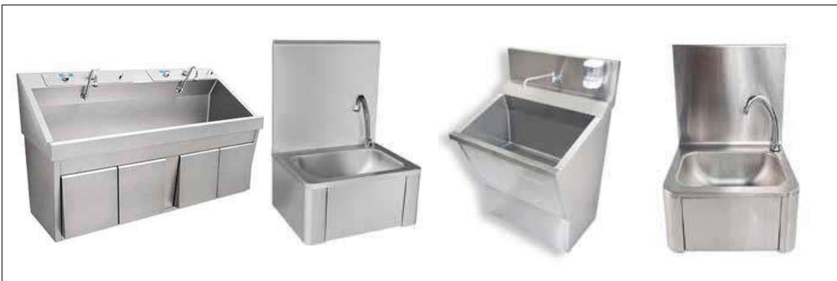
AND-F2364/ AND-F2365/ AND-F2366/ AND-F2367