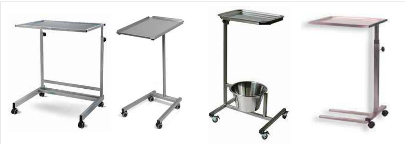
AND-F2325/ AND-F2326/ AND-F2327/ AND-F2328