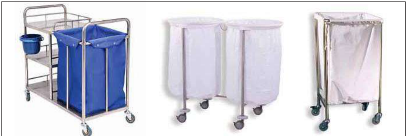
AND- F23125/ AND- F23126/ AND- F23127