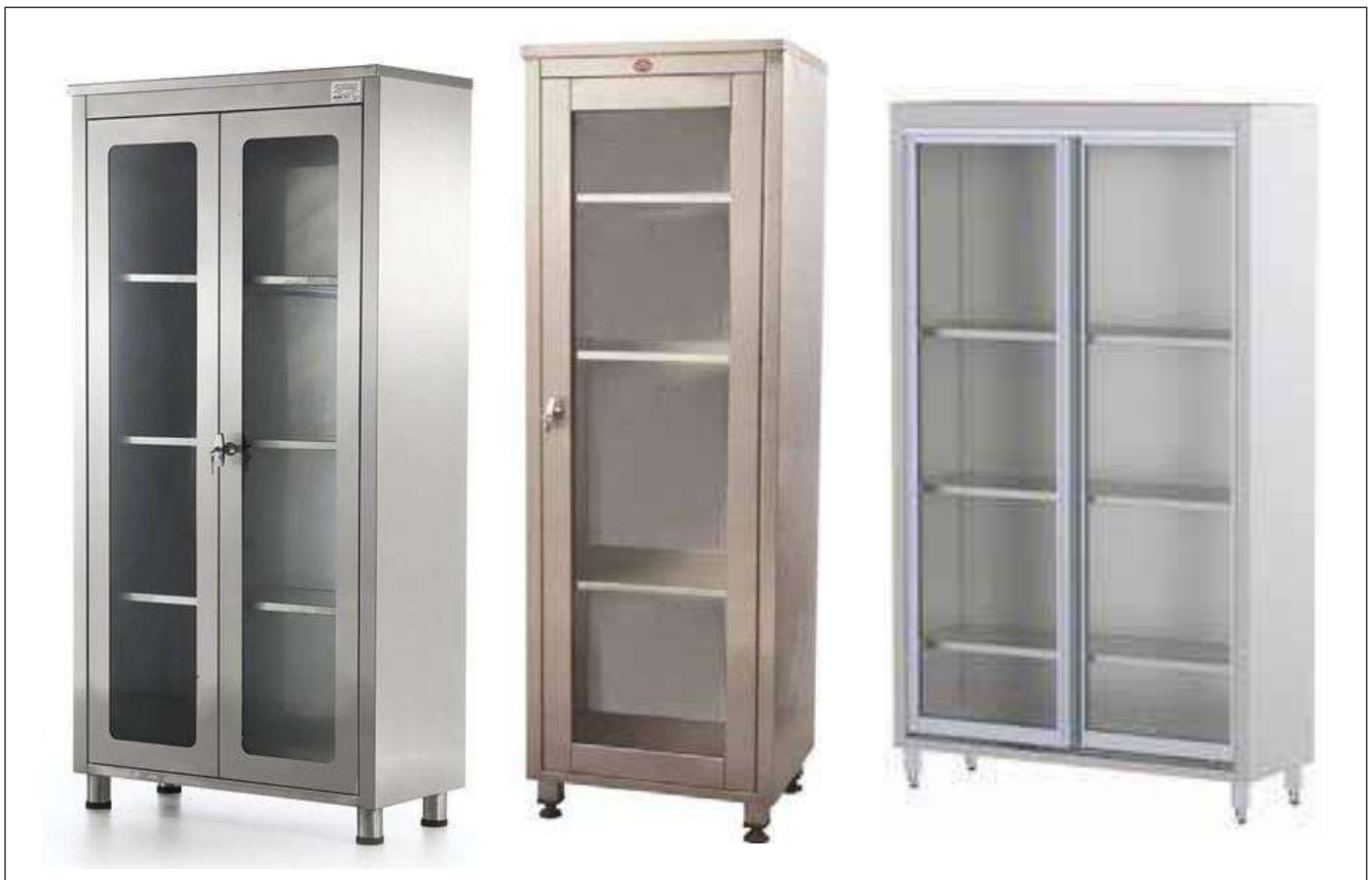
AND-F2356/ AND-F2357/ AND-F2358