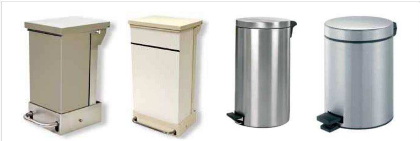
AND-F2379/ AND-F2380/ AND-F2381/ AND-F2382