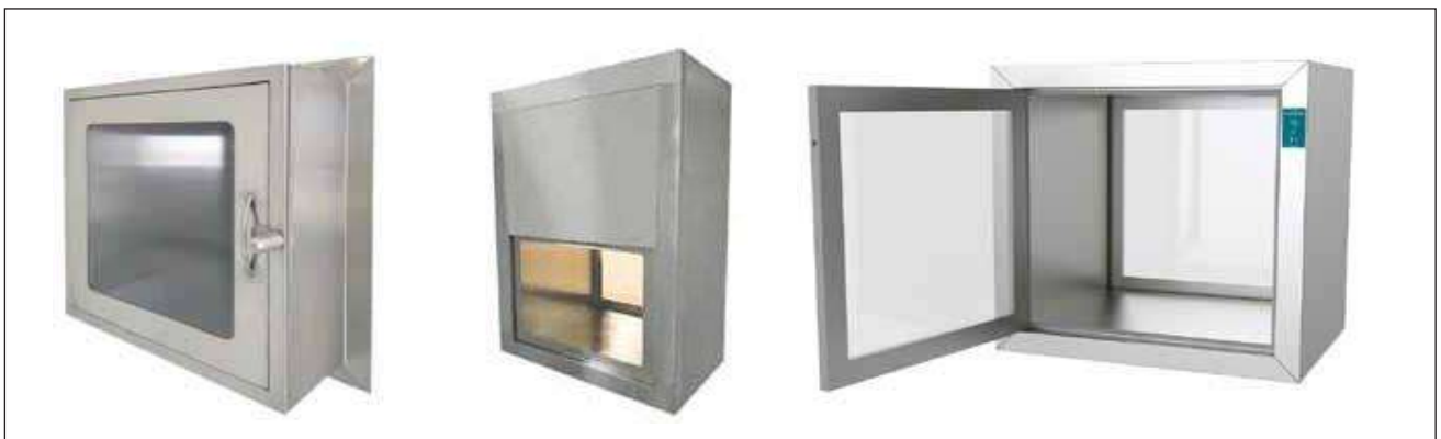
AND- F2393/ AND- F2394/ AND- F2395