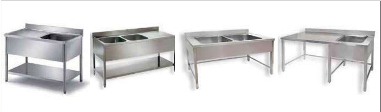
AND-F2375/ AND-F2376/ AND-F2377/ AND-F2378