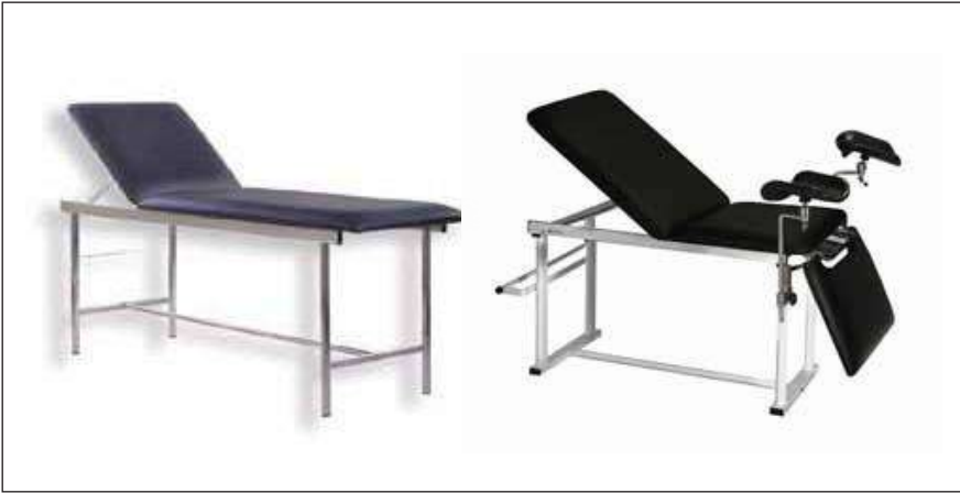
AND- F2390/ AND- F2391