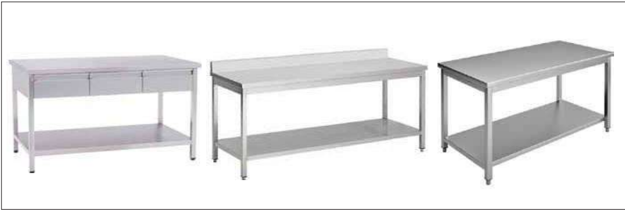
AND-F2359/ AND-F2360/ AND-F2361