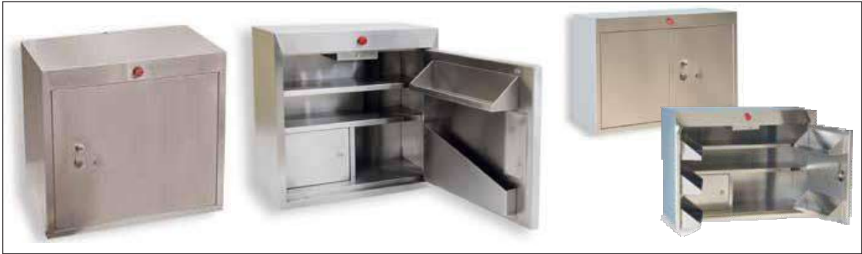
AND-F2344/ AND-F2345/ AND-F2346