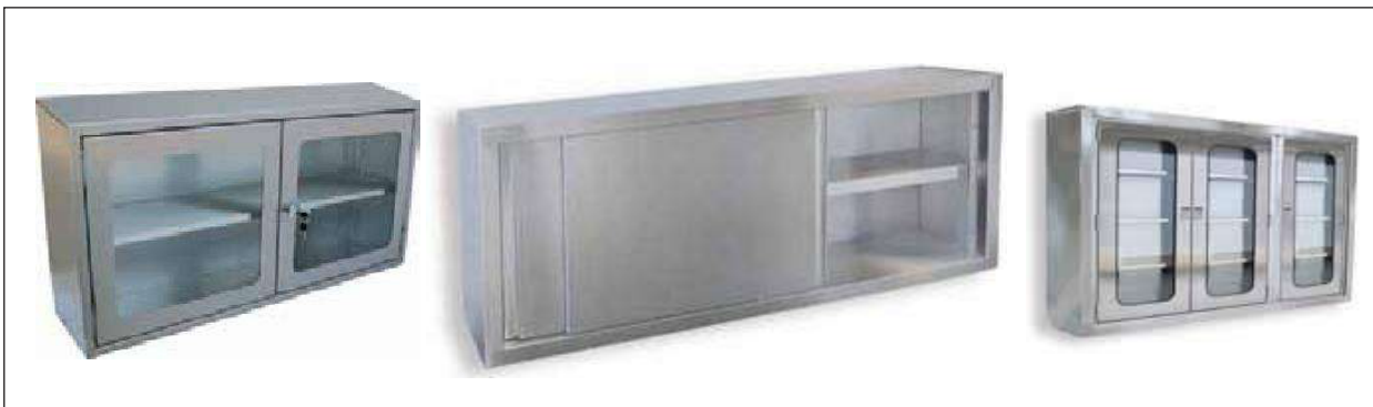
AND-F2341/ AND-F2342/ AND-F2343