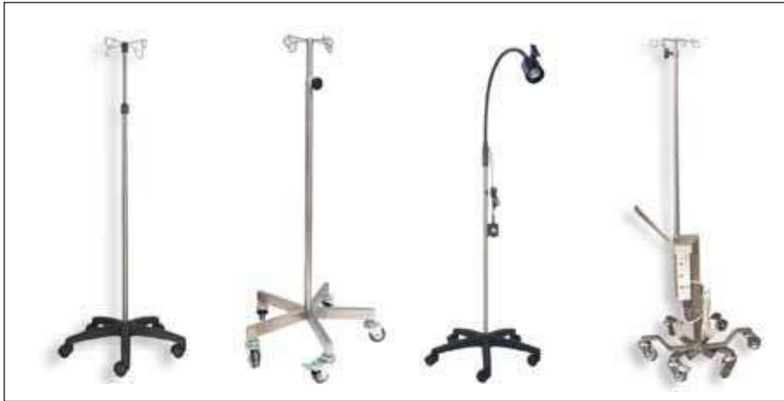
AND-F23104/ AND-F23105/ AND-F23106/ AND-F23107