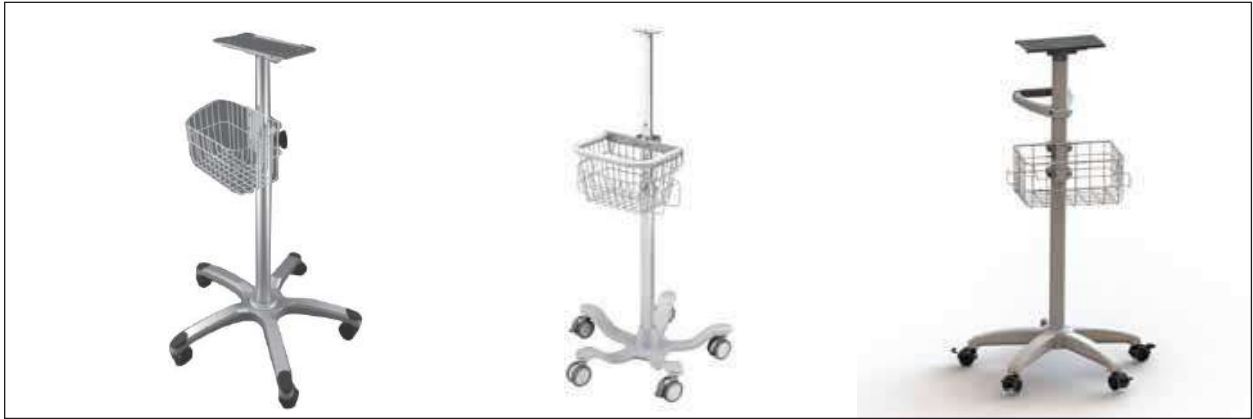
AND-F23112/ AND-F23113/ AND-F23114/ AND-F23115/ AND-F23117