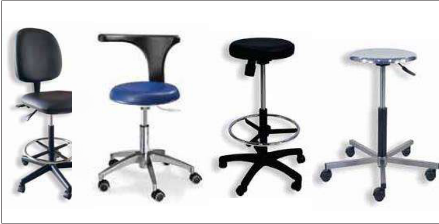
AND-F23100/ AND-F23101/ AND-F23102/ AND-F23103